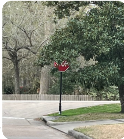
Example of vegetation obstructing stop sign