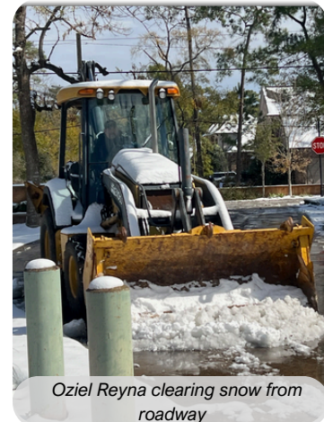
Oziel Reyna clearing snow from roadway