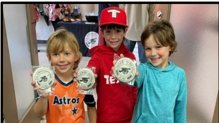
We loved seeing our younger residents at the Open House!!